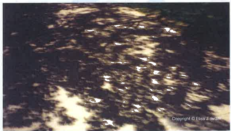
Sunlight from a partial eclipse funnels through tree leaves to project images of crescents on the ground.